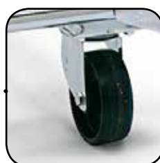
Sandwich Ø 125 mm casters with a shock absorbing ring incorporated into the wheel.