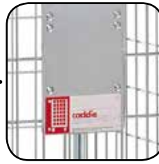
Metal name plate for clear identification.