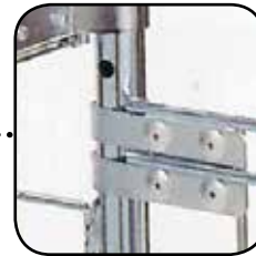
Opening 1 door which completely folds back. One-piece structure for a direct transmission of handling efforts.